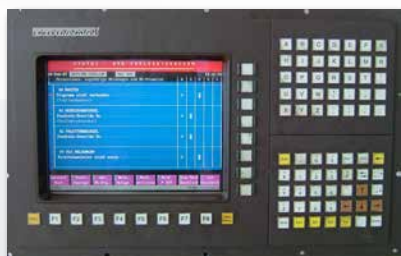
Original: Bosch Indramat BTV