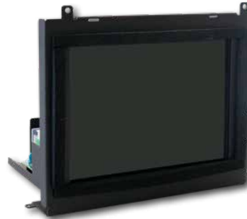
Replacement: unipo® UFP3