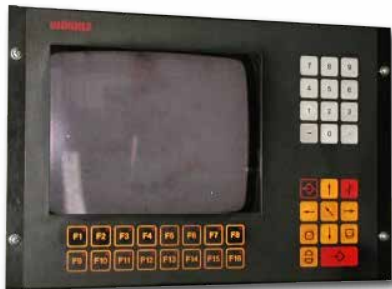
Original: Wöhrlé CB-09