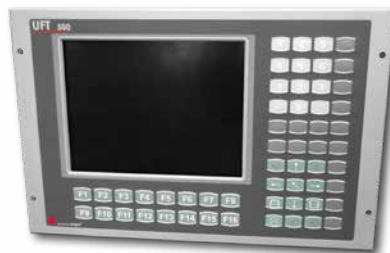
Replacement: unipo® UFT500