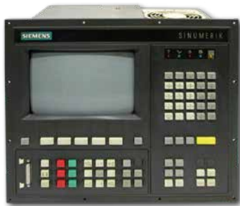
Original: Siemens Sinumerik 810