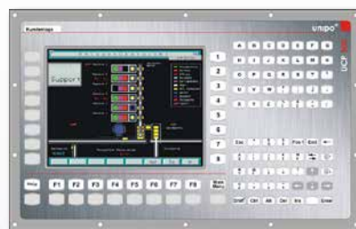
Replacement: unipo® UCP500